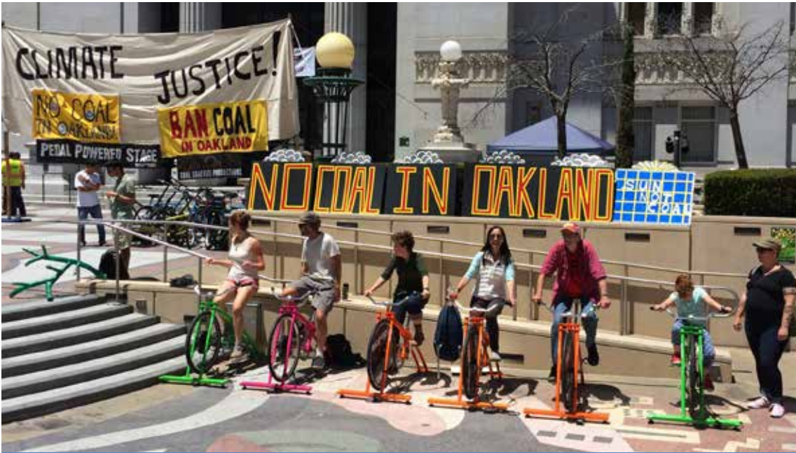
People Power Beats Coal: Community members make their own juice to power No Coal Rally

This year, we saw public agencies listen to grassroots organizations and say, 'health matters.'